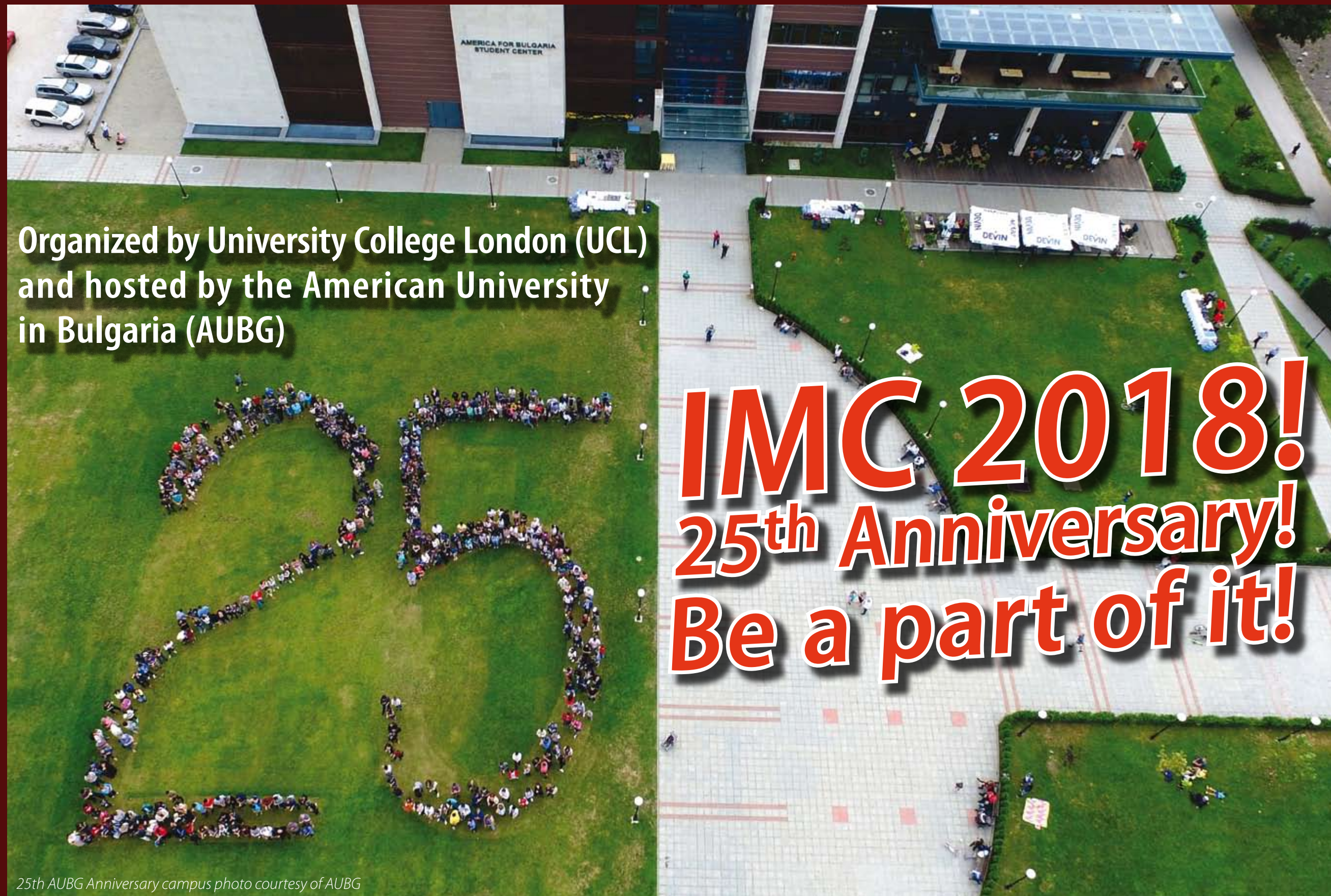
25th AUBG Anniversary campus photo courtesy of AUBG